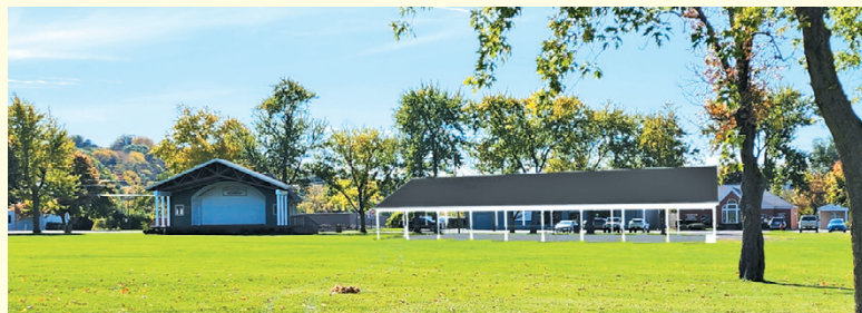
Academy Park pavilion drawing courtesy of Fittante Architecture.